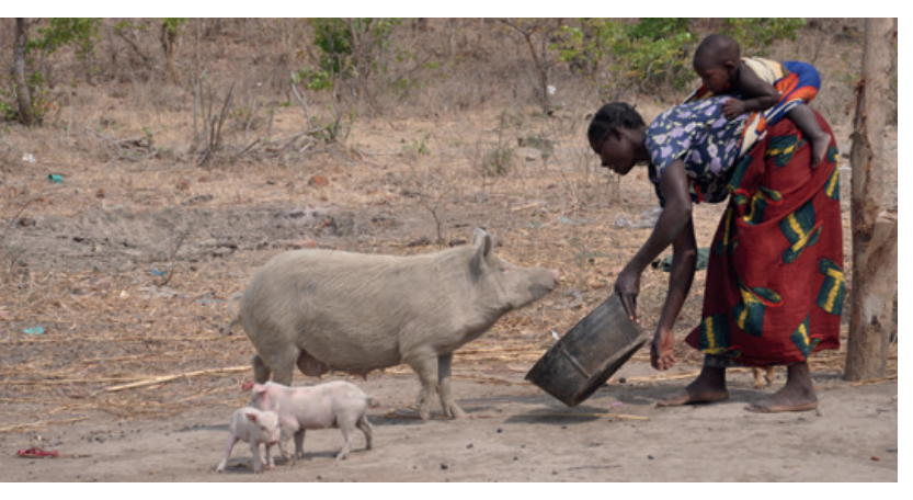
Free-roaming pig husbandry practices in the southern province of Zambia

TSCT represents a poverty-related, neglected zoonotic disease complex with a strong One Health aspect, which is endemic throughout sub-Saharan Africa. Human cysticercosis clinically manifests itself mainly as NCC, which is considered the most frequent preventable cause of epilepsy in sub-Saharan Africa, where approximately 6 million people suffer from NCC. Owing to globalisation and the migration of infected people, NCC is of increasing concern in as yet non-endemic European countries.